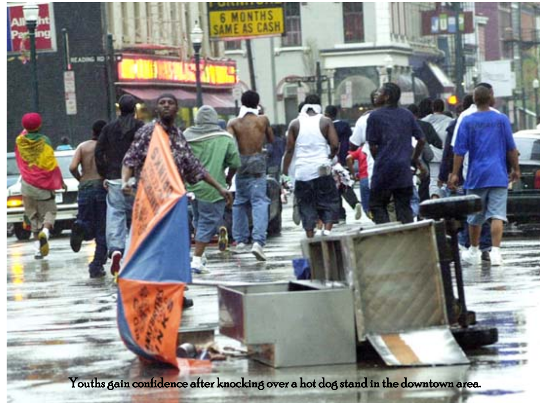
Youths gain confidence after knocking over a hot dog stand in the downtown area.

Over the last decade or so, the "zero tolerance" school of policing first introduced in Giuliani's NYC has spread to dozens of other cities, including Cincinnati. Police forces which have converted to the "New York model," along with the introduction of a new chief or FOP [Fraternal Order of Police] president trained in New York, emphasize tighter discipline in the ranks and an increased independence of the police as a political force in the city's politics. This means that police "partnerships" with social service agencies, drug treatment facilities, etc., are being neglected or dropped, states attorney's offices are being pressured to reorganize their priorities for prosecutions in line with police strategies, and that ghetto areas (especially those with real estate potentials) are targeted with relentless zero-tolerance pig saturation.